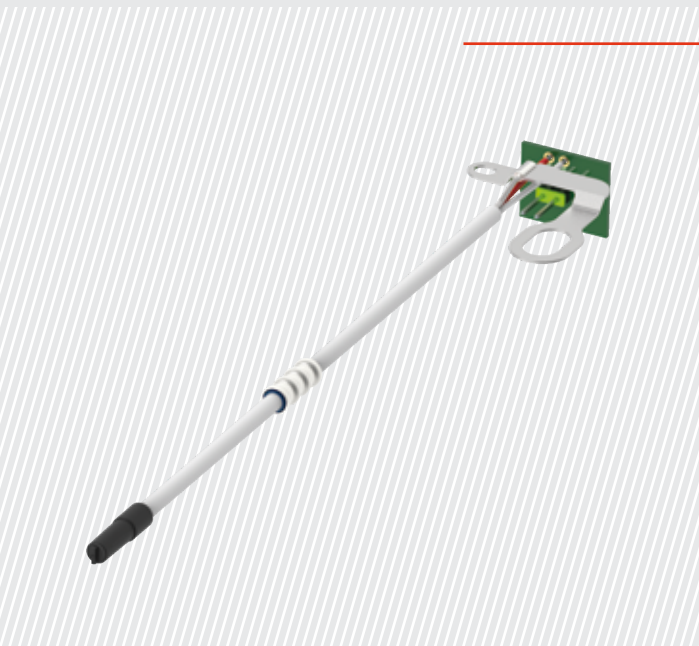
NTC temperature sensor assembly integrated in the stator of the electric drive motor