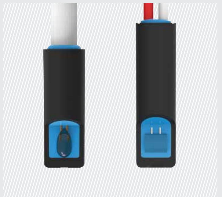
NTC temperature sensor (sectional view)